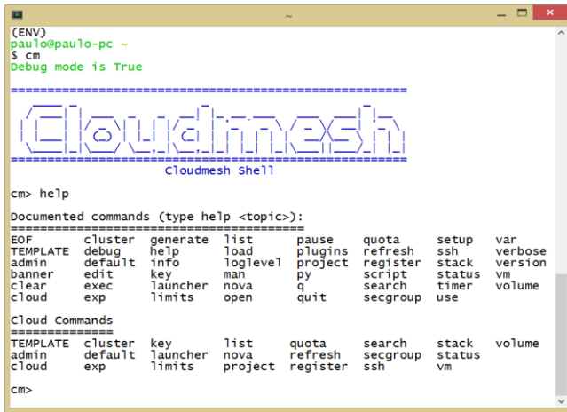
Figure 2. Cloudmesh running on Cygwin

Figure 2 shows a screenshot of the Cloudmesh Shell upon startup. Figure 3 shows virtual machines started with Cloudmesh through OpenStack Horizon.